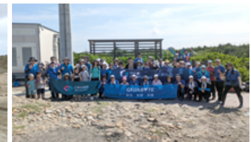
Cumulative participants: 615 person-times Total Trash Removed: 8,205.2 kg